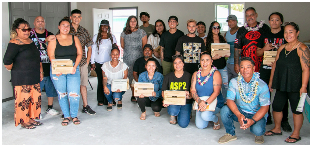
Ten Hawai'i Island families gathered in July to celebrate the milestone of homeownership.

The Hawai'i Island Community Development Corporation (HICDC) blessed the second and final phase of its 'Āinaloa Mutual Self-Help Housing Program during a ceremony held Friday, July 19, 2024.