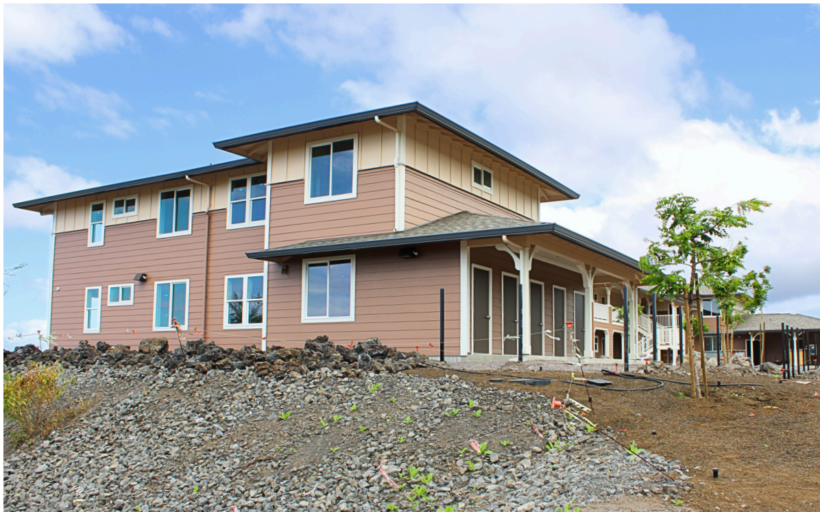
Families are anticipated to begin moving into Kauhale I Ke Kula Uka in December 2024.