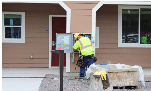
A crewmember works on a utility box at Kauhale I Ke Kula Uka.

families earning 30% to 60% of area median income (AMI). Five of the units are set aside for eligible households with children that are experiencing homelessness, at-risk of becoming homeless, or transitioning out of