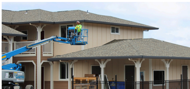
Kauhale I Ke Kula Uka is located at 73-4515 Hina Lani Street.

Applications may be obtained and submitted online at www.hawaiiaffordable.com ; in-person at the Hawaii Affordable Properties Inc. office at the Honalo Business Center, located at 79-7266 Mamalahoa Highway, Suite 1, Kealakekua, Hawaii, 96750; or via U.S. Mail by calling (808) 322-3422 (TDD: 877-447-5990), sending an email to