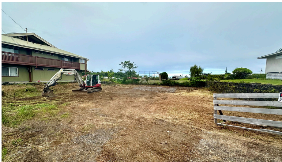
HALE O Hawai'i County Community Land Trust started work this month on single-family homes in Hilo and Volcano fully funded by the County's Affordable Housing Production Program (FY 2023-24). Pictured above is the future site of one of these homes on State-owned land conveyed to the County by an executive order then leased to HALE O Hawai'i as part of a pilot project that will provide a template for development of single-family affordable housing on State-owned lands under a land trust model. Once complete, the homes will be sold to eligible purchasers under a long-term generational leasehold in which immediate family may inherit the lease. For more information on HALE O Hawai'i, please visit https://haleohawaii.org.