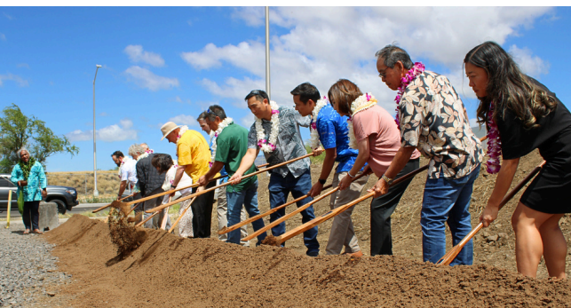
Dignitaries use the o'o (digging stick) during the groundbreaking ceremony to start of construction on Nā Hale Makoa.