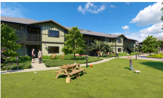
Nā Hale Makoa is seen in this artistic rendering. Families are expected to begin moving into units during the first quarter of 2026.

"Today marks a pivotal step forward in our commitment to addressing the affordable housing needs of our community. Nā Hale